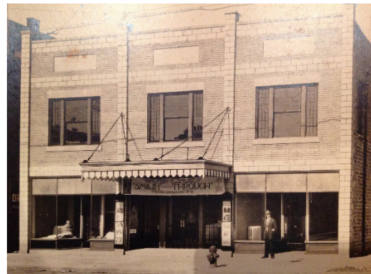
Smalley's Theatre photo (left)