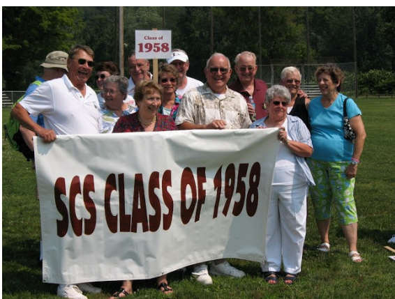
Happy 55th Class of '58!

After graduation, she will be attending college for Nursing (with future plans to become a Nurse Anesthetist). She has been accepted to SUNY IT in Utica, the 1+2+1 Nursing program. This program only accepts 30-35 students each year. She will attend SUNY IT and the St. Elizabeth School of Nursing 4 Year program.