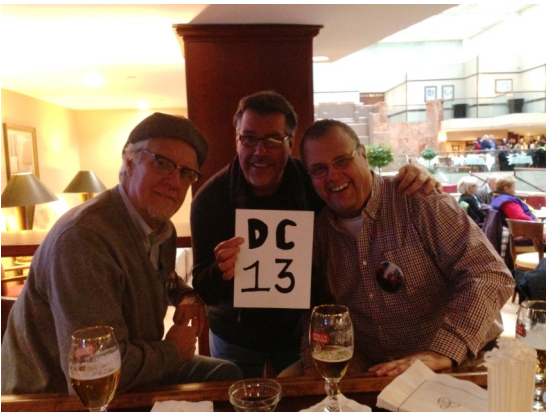
ANNUAL BROTHERS’ WEEKEND