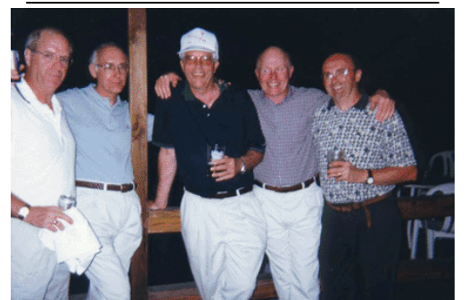
"The Boys of '65" a few years ago.