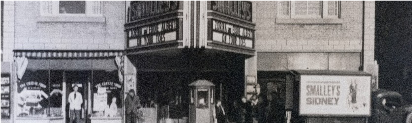
Smalley's Theatre, (circa 1939)