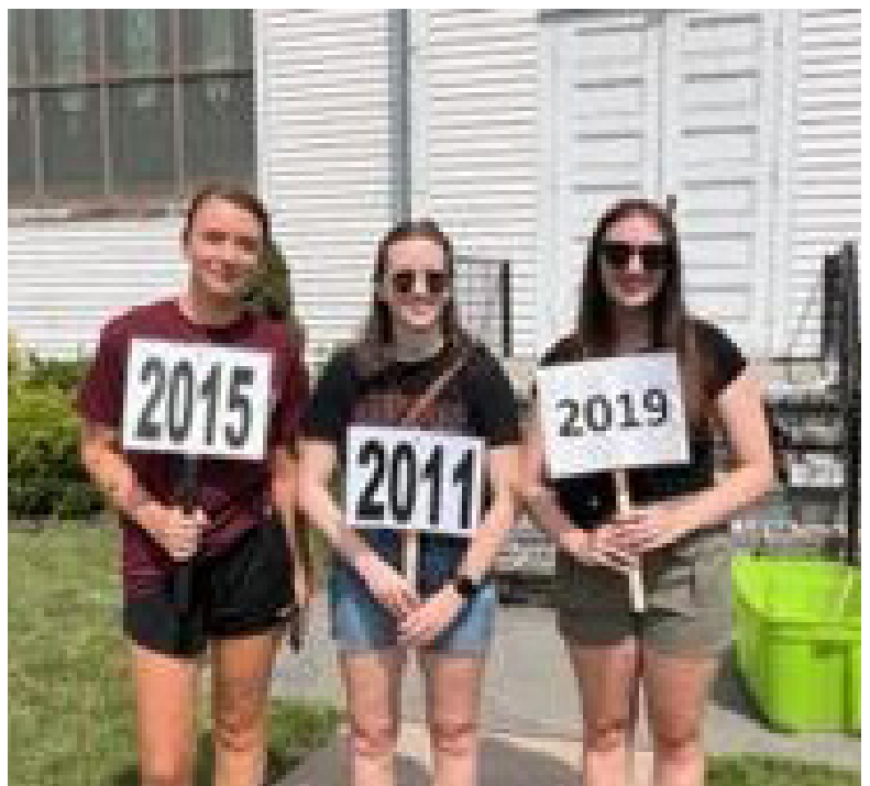
MARCH OF THE CLASSES, CONT.