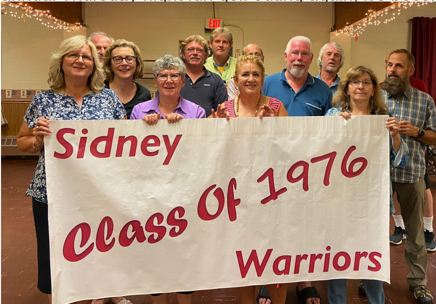
Class of 1976

While numbers were low (see class pictures), mostly due to the return of pandemic-related concerns, both classes had other members that popped into the VFW or golfed earlier in the weekend. Classmates from 1976 especially enjoyed their annual Thursday night fun golf outing again; it's become an annual tradition.