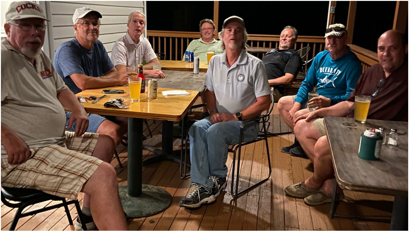
Thursday '76 Boys