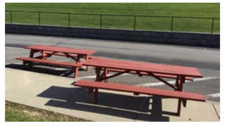
Picnic tables built by Sidney High School Students for the Sidney Center Park & Playground

Follow the group's progress or learn how to contribute by visiting "Sidney Center Improvement Group, Inc. (SCIG)" on Facebook.