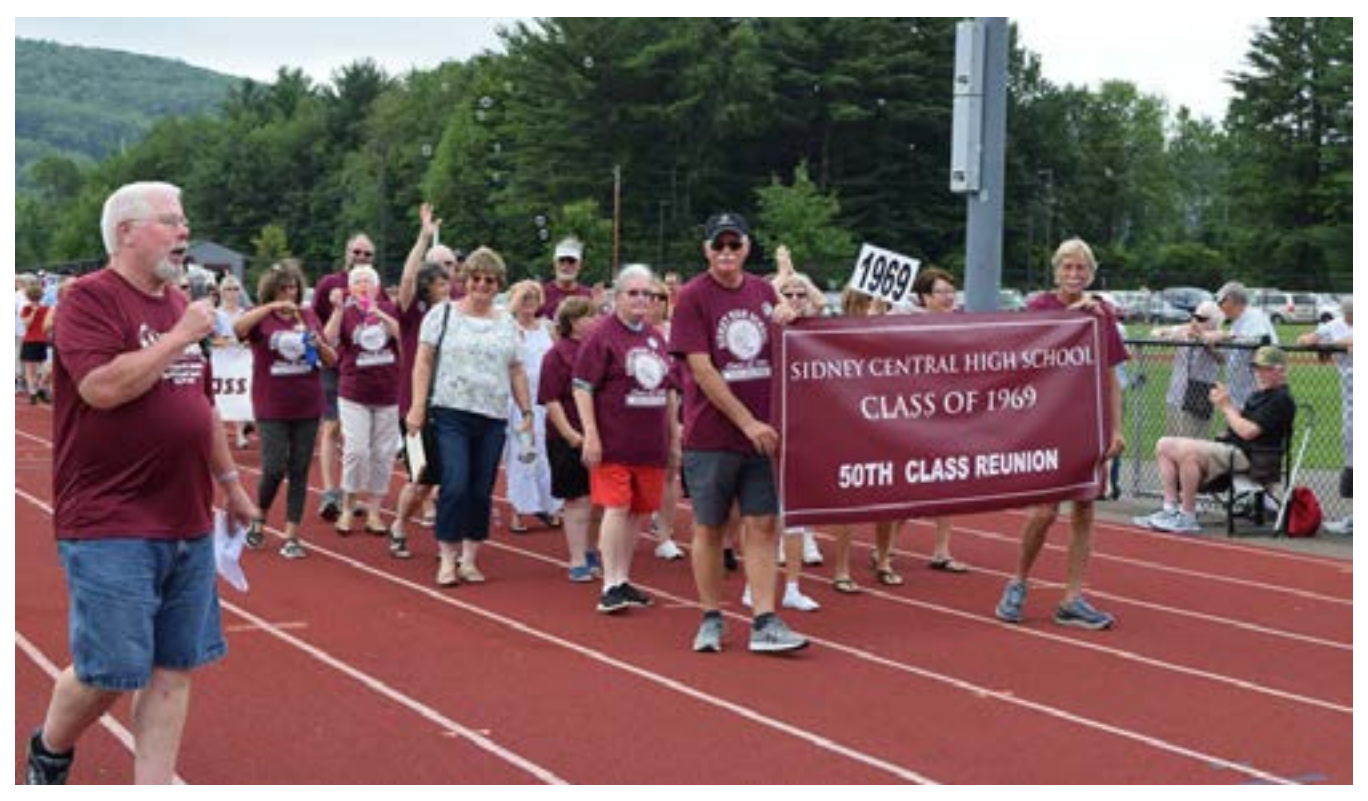
Members of the Class of '69, celebrating their 50th reunion, process in the March of Classes at Alumni Weekend 2019.