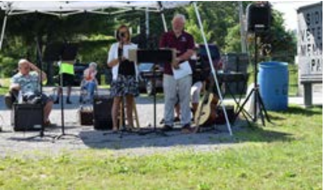
Names are read during the in memoriam portion of Sunday's Alumni Weekend events at the Sidney Veterans Memorial Park on River Street.

After an incredibly hot day on Saturday, alumni showed up that evening for an event at the Elks Lodge, where everyone enjoyed some music from our DJ and socializing.