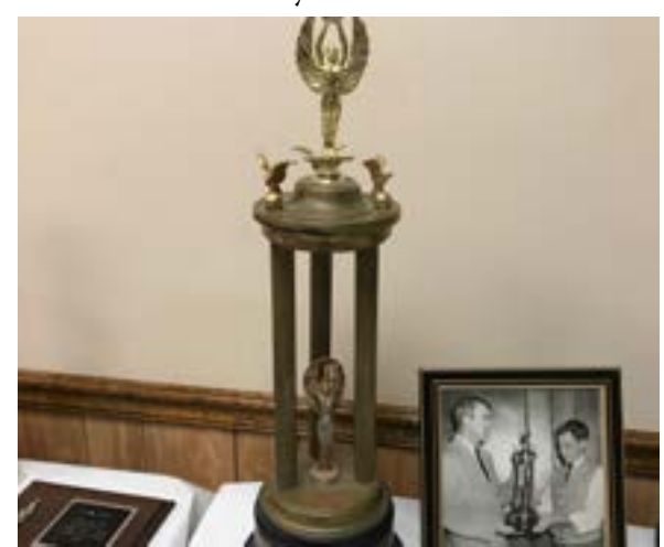
The original, 1958 Ralph Pyle trophy is dispalyed at this year's SHOF dinner and induction ceremony.