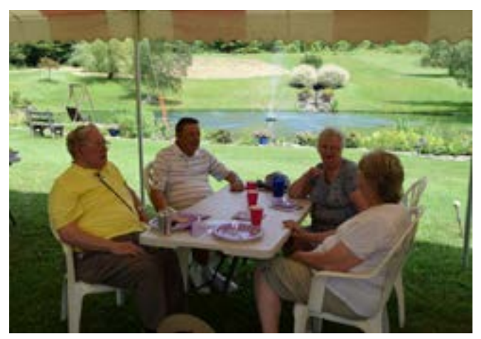
Members of the Class of '56 enjoy a picnic during Alumni Weekend 2019.