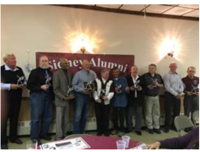
The Legacy Lineup pauses for a picture during this year's SHOF induction ceremony.